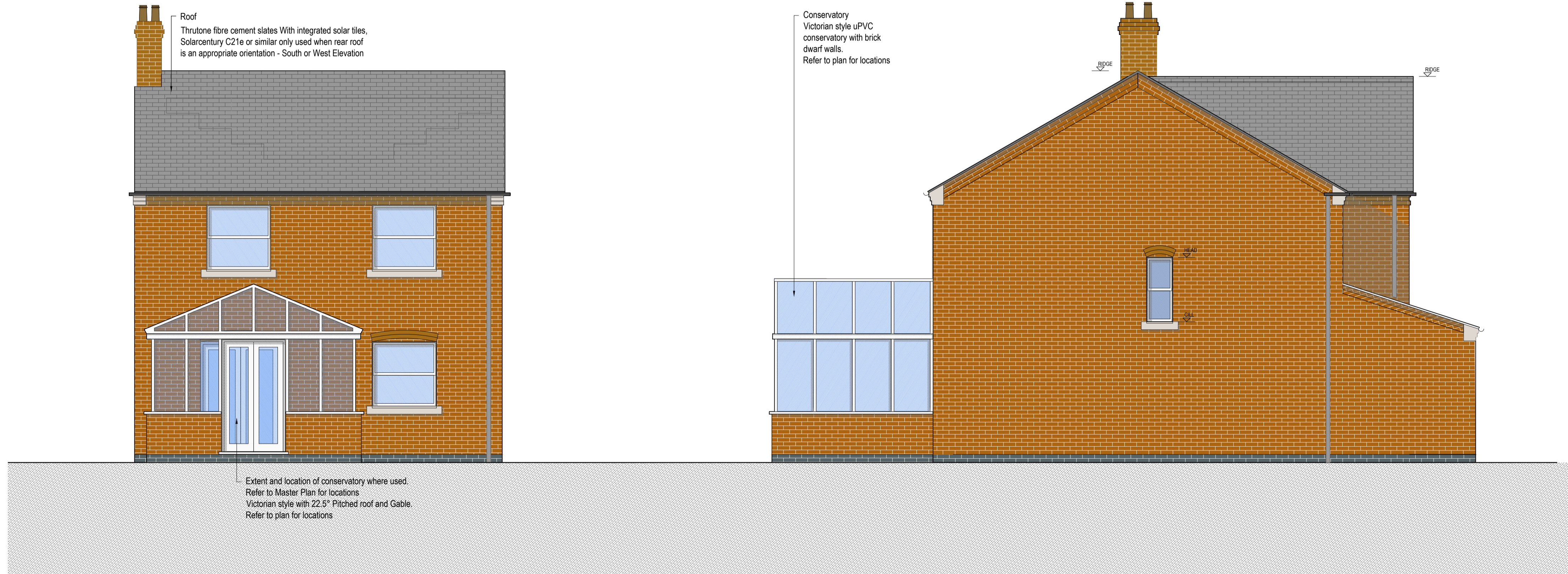
C Rear Elevation